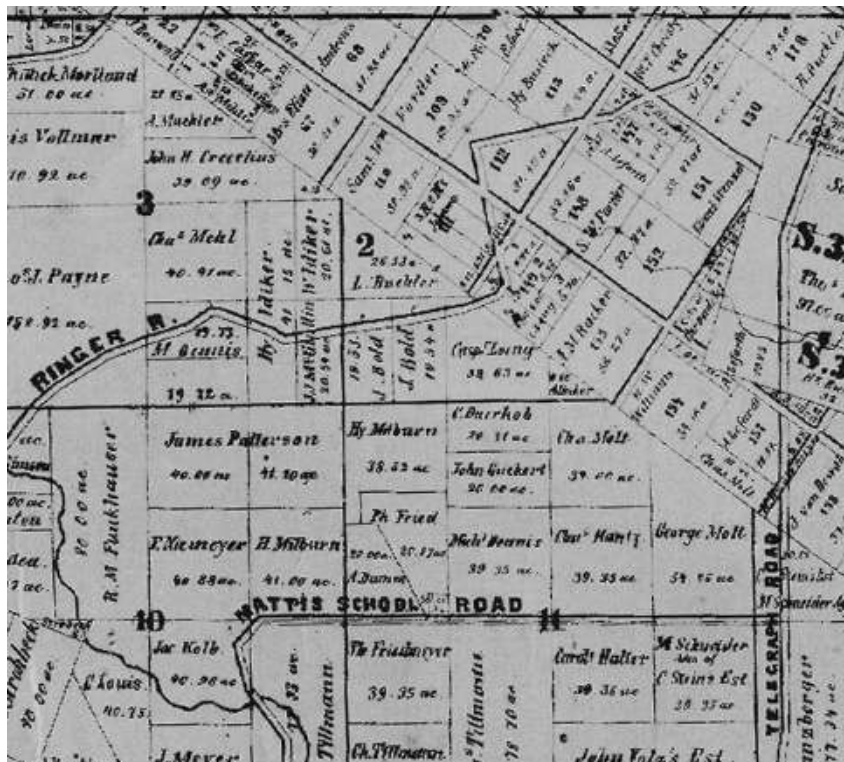
Figure 1- Pitzman's 1868 Map of St. Louis 5

During the 1840s and 1850s many settlers came to the area and began farming in the Carondelet Township. Samuel W. Forder purchased land in 1852 and built a log cabin, stone storage building, and a frame house. He married Anna Vista Conn and established a family whose descendants still live in the area. Forder’s legacy also lives on in the area through Forder Avenue, which was name ‘Forder Road’ in the section from Lemay Ferry to Telegraph in 1969. 1234