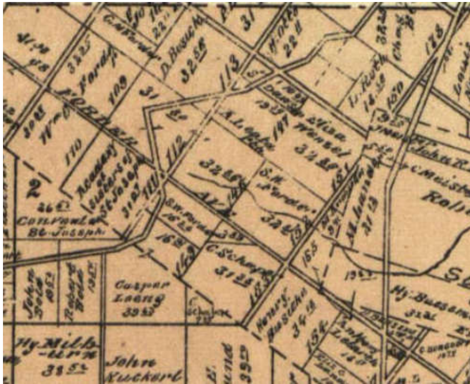
Figure 3 - 1893 Atlas of St. Louis County 12