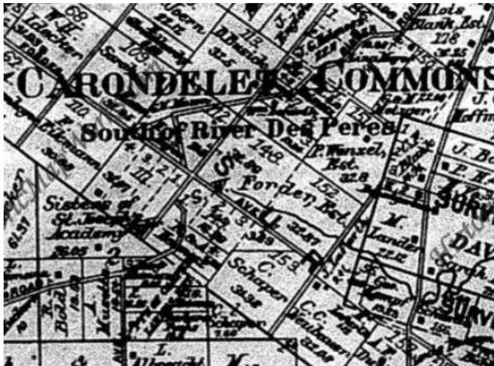
Figure 4 - 1909 Plat of St. Louis County 13

According to St. Louis County records, the house at 628 Forder was built in 1933. 14 Census records indicate no numbered houses along Forder Road, as is often the case in rural communities. The area was grouped under Lemay (rural route) in the city directories and since there were no house numbers registered in the 1930 or 1940 directories, we must look to more modern records and work our way back. [see the chain of ownership enclosed]